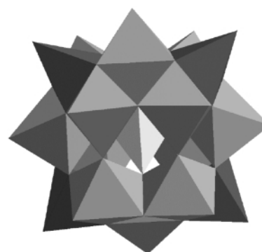
Fig. 1 Compact arrangement of complex 1 . Trigonal bipyramids correspond to the black polyhedra, octahedra to the grey polyhedra and the tetrahedron to the white polyhedron.

A variety of stable polyoxo-tungstate and -molybdate compounds display this structure type. The arrangement has a paramount importance in the construction of metal-oxo cores in heteropolyanion chemistry. 10 The metal-oxo core of the